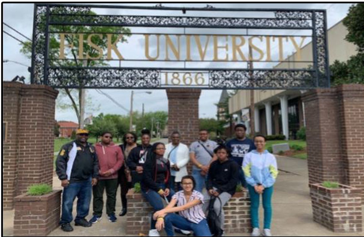
2019 High School TSTM College tour to Memphis & Nashville, TN (Fisk University)

The past year, 72 middle and high school students actively participated in the TSTM program. Out of the 72 students, 71 (99%) of them gained knowledge and demonstrated learned skills. Every one of the high school seniors (100%) enrolled in the program was accepted into a four-year college/university and received at least one scholarship.